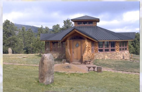
The StarHouse in Boulder, Colorado

MountainSeas on Flinders Island in Tasmania, Australia, complements the StarHouse, and is another site where Sophia can be easily felt.